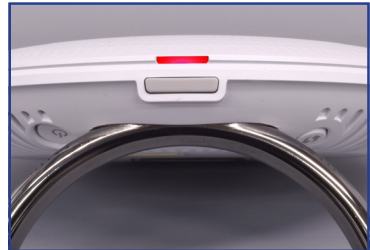
Fig. 2: Red LED. Booster is ready for configuration.