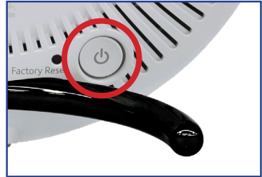
Fig. 1: Power button.