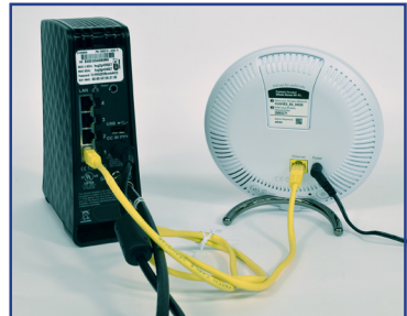
Fig. 3: Connect the Booster to the HT2000W.