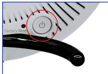
Fig. 6: Power button.