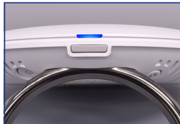
Fig. 5: Blue LED – Synchronization is complete.